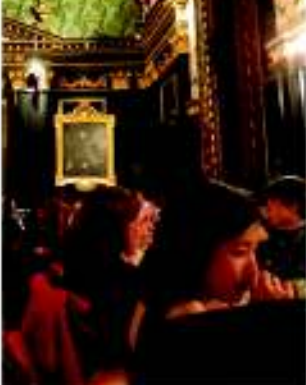
Quatuor Coronati Tercentenary Conference