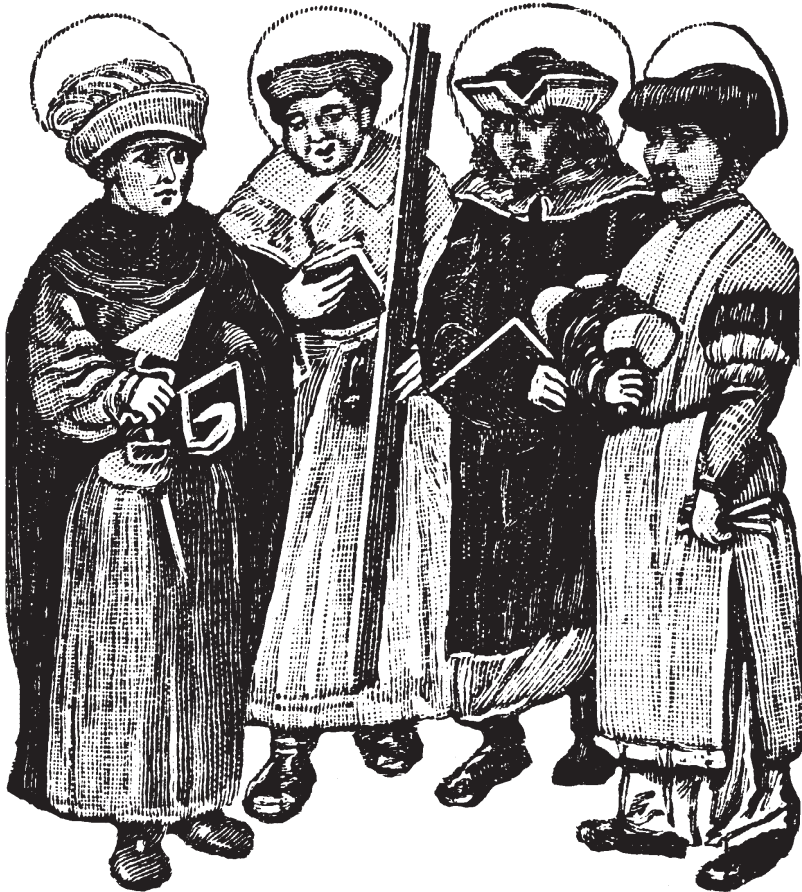
From the Isabella Missal, British Library, Add. Mss. No. 18,851