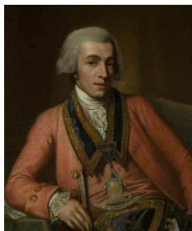
Joseph Montfort (d.1776)