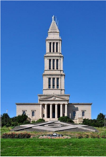
The George Washington Masonic National Memorial Alexandria, VA

Please note that events, panels and speakers may be subject to change. Please see the detailed conference program at www.quatuorcoronati.com .