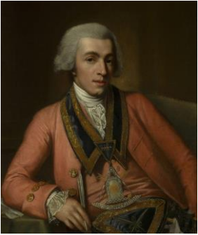
Joseph Montfort (d.1776)