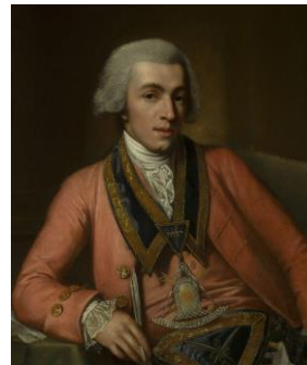
Joseph Montfort (d.1776)