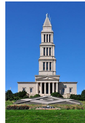
The George Washington Masonic National Memorial Alexandria, VA

Please note that events, panels and speakers may be subject to change.