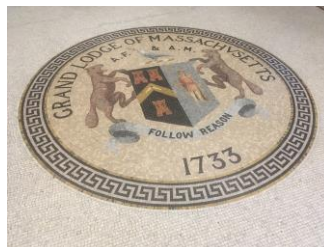
Seal of the GL of Massachusetts