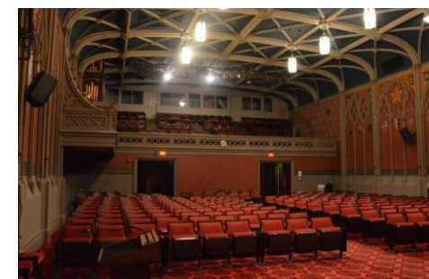
The Gothic Room

Please note that events, panels and speakers may be subject to change.