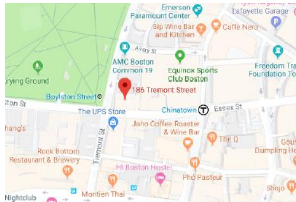
Grand Lodge of Massachusetts 186 Tremont Street, Boston, MA

The Boylston Street Subway Station is only a few yards from the Grand Lodge building and Green lines B, C, D and E stop at the station. Red and Orange lines stop at stations nearby (Park Street & Chinatown). The Silver Line - SL1 - links Logan International Airport to Boston’s South Station.