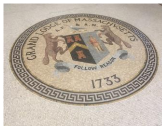
Seal of the GL of Massachusetts