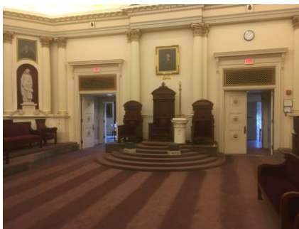
Grand Lodge Room